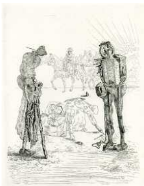
Dalí, Les Chants de Maldoror , 1934