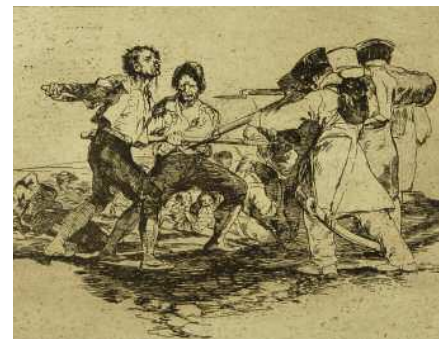
Goya, Los Desastres de la Guerra , 1810

In 1934, Salvador Dalí was commissioned by Albert Skira to illustrate Les Chants de Maldoror by Isidore Ducasse (Montevideo, 1846 - Paris, 1870), Count de Lautréamont, the "damned", marginalised poet, who died young in strange circumstances, already become a myth of the amorality and the automatism proposed in the First Manifesto of surrealism in 1924. His aggressive writing and nervous poetry built up a literary machine in which the word sought action through impulsive,