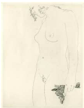
Dalí, Les Chants de Maldoror , 1934