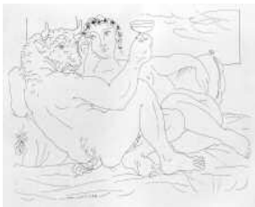
Picasso, Suite Vollard , 1933