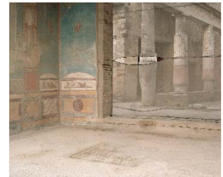
Domus, Pompei, 2008. Typologies series

memorialization and on the conditions of monumentalization of memory. The first series was shot in Berlin, a city where the direct relationship between memory and monument is especially important, and their work explores a number of complex issues associated with this powerful binomial: the materialization of memory in the fabric of the city; the status of places of remembrance; the inscription of trauma in the fabric of the city; the progressive loss of function of memorials, and the relationship between memory and forgetting.