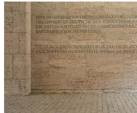
Bendlerblock, Stauffenbergstrasse, 2005. Memorials / Berlin series.